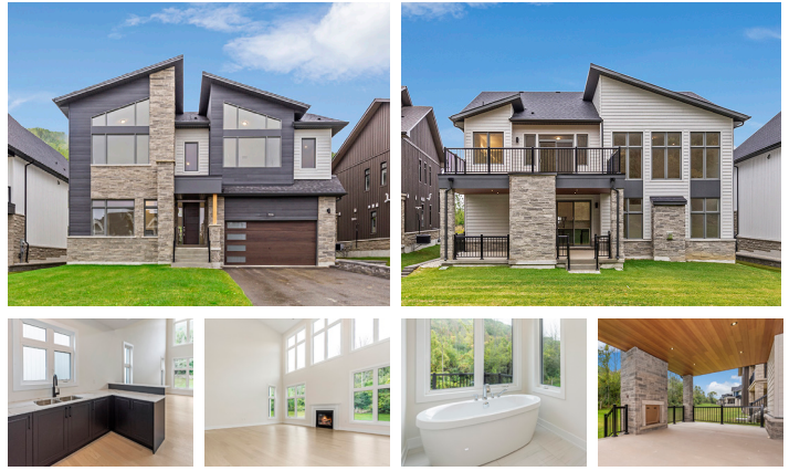
REAR ELEV D